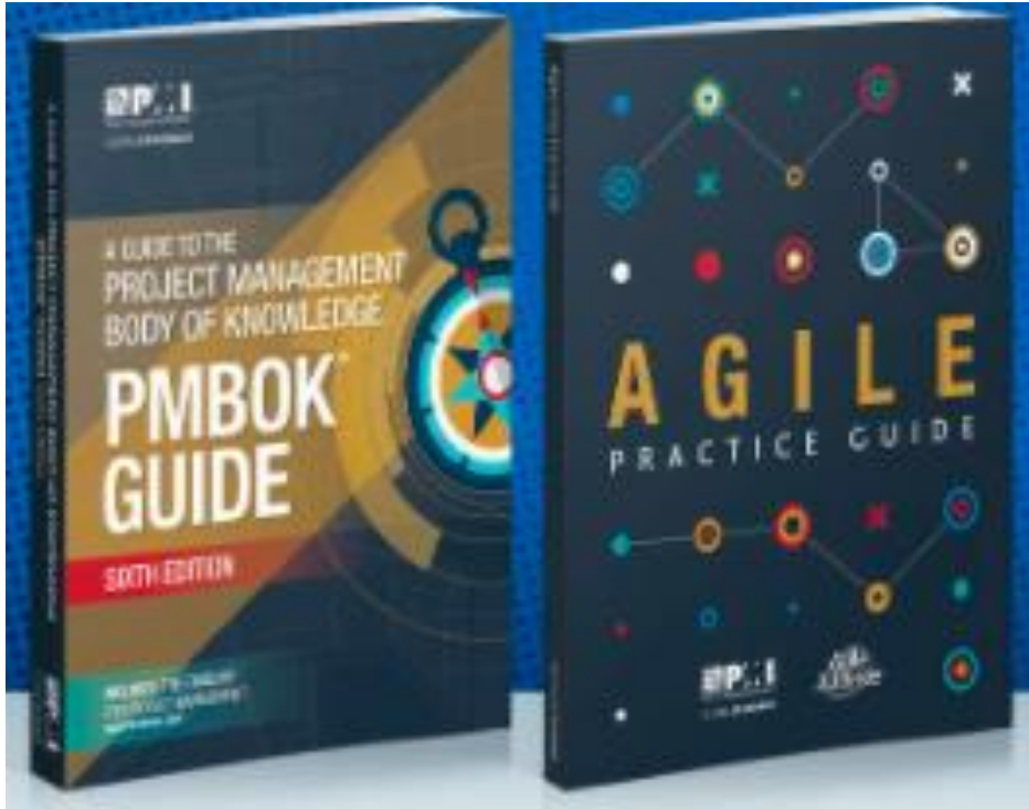
PMBOK® Guide-Six Edition